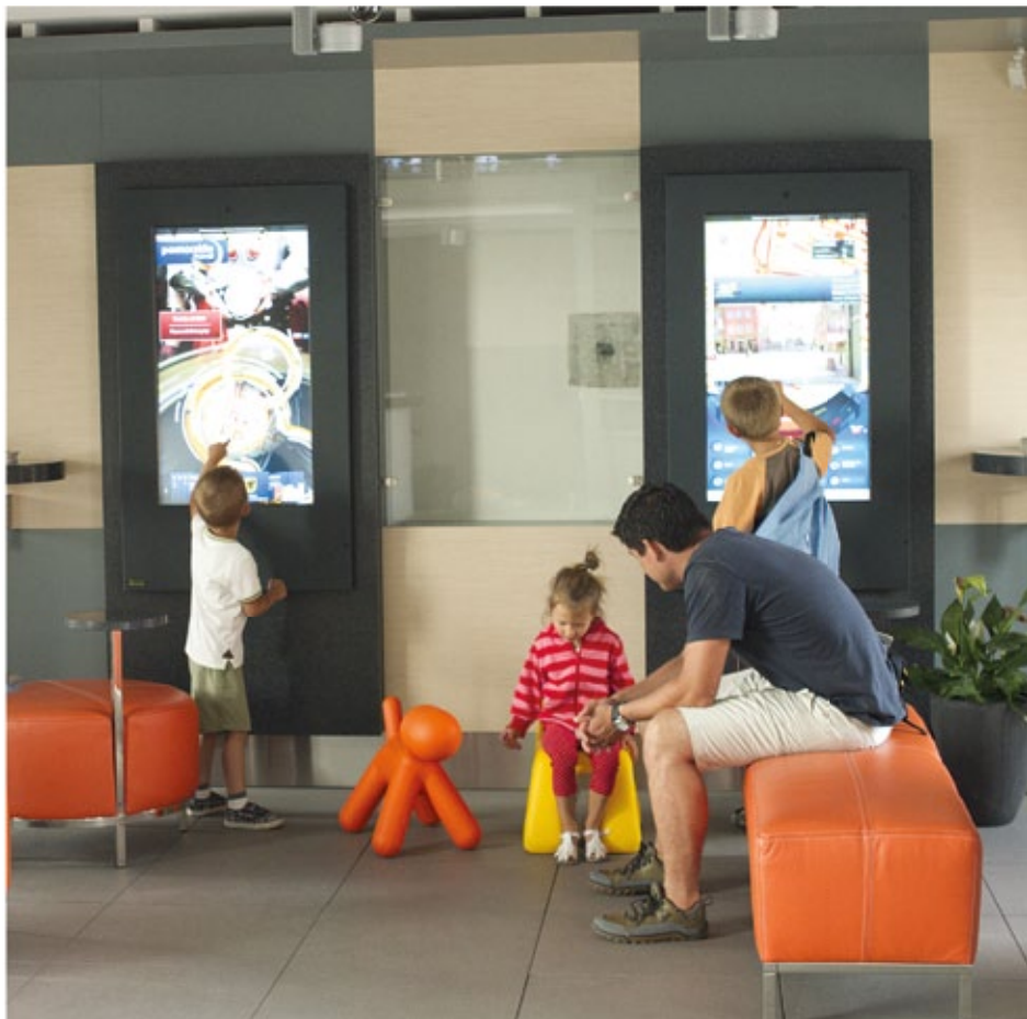
The interactive indoor LCD STANDS with 42" touch screen