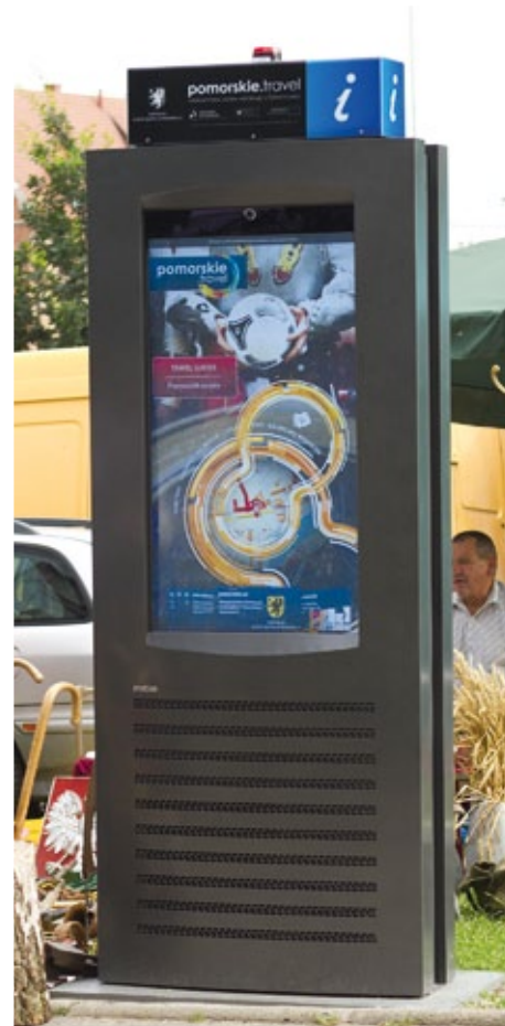
The interactive outdoor LCD STAND with 46" touch screen

ISIT , the Interactive Tourist Information System as part of the initiative Pomorskie.travel is the largest and most modern tourist information network in Poland and Europe, using interactive technology of digital signage in public spaces.