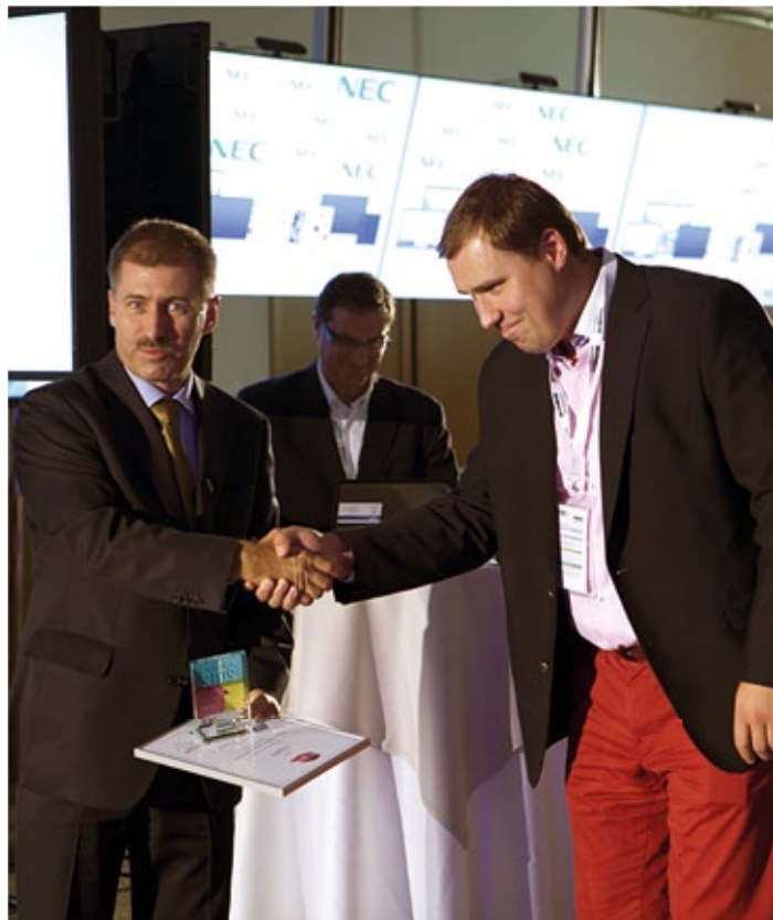
DDS Poland is the leader in digital signage – testify by the awards and nominations