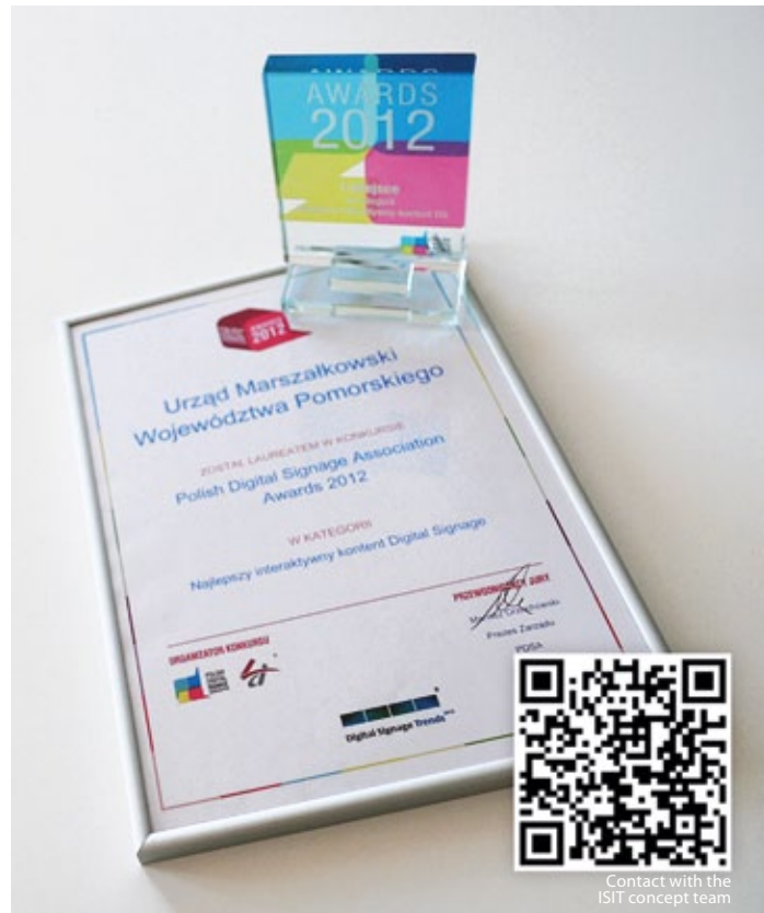
PDSA 2012 Award for the Marshal Office of the Pomeranian Region - first place in the category: „Best Interactive Contents DS”

The network of LCD STANDS within Pomorskie.travel project has been implemented with great success, which was proved by the Polish Digital Signage Association award - first place in the category of Best Interactive DS contents.